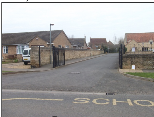
Access onto Main Street