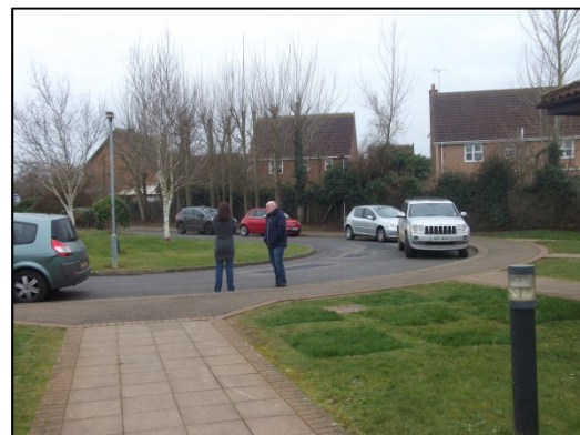
Car parking & access roadway